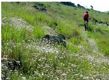
Rocky Ridge Trail

http://www.stpfriends.org/BernalHill-Spring08/Bernal-Hill-1.html , which also has links to other pages.