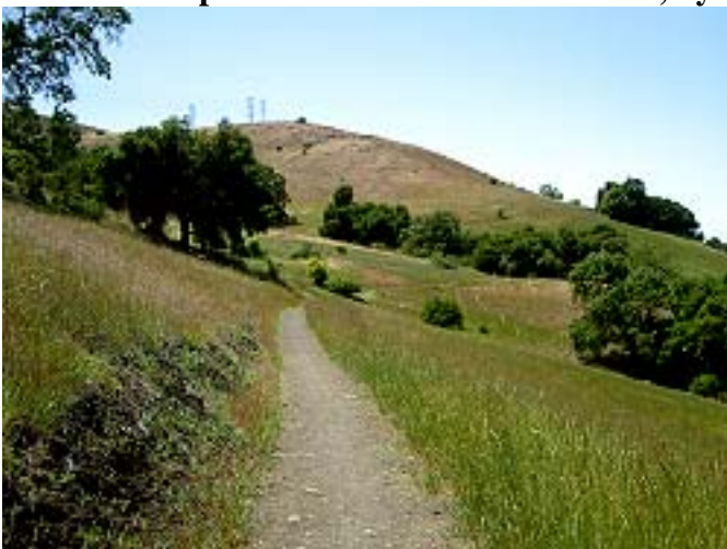
On the Norred, looking back towards the Joice Trail