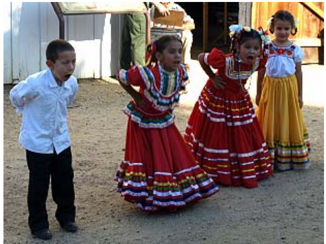
Dancers from El Grito de la Cultura