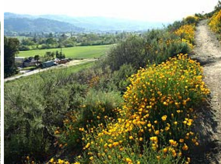
Stile Ranch Trail