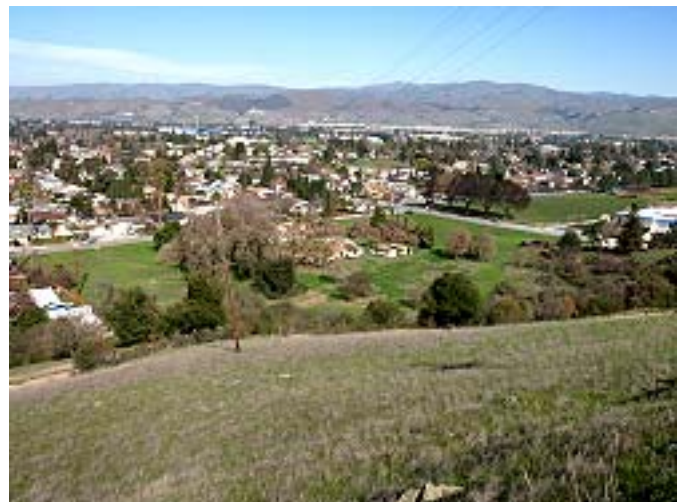
View of the historic site at Curie and San Ignacio