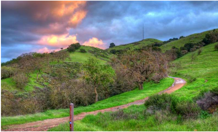
The Hidden Springs Trail leading to Coyote Peak