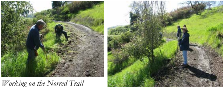
Working on the Norred Trail

For further information or to adopt a trail contact; Volunteer program 298 Garden Hill Dr., Los Gatos, Ca. 95032 (408) 355-2254 or sign up on www.parkhere.org .