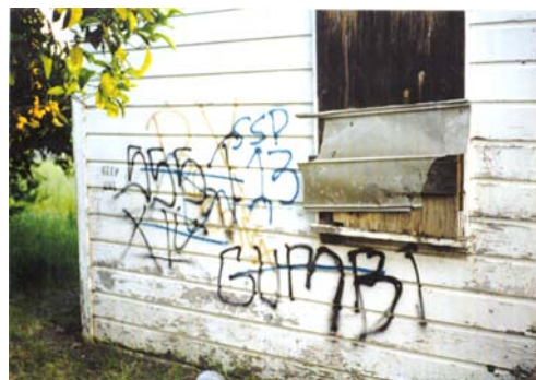
Historic buildings at the Joice-Bernal Ranch were tagged and vandalized before they were restored and turned into an interpretive center at the Santa Teresa Historic Area.