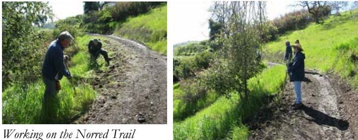
Working on the Norred Trail

For further information or to adopt a trail contact; Volunteer program 298 Garden Hill Dr., Los Gatos, Ca. 95032 (408) 355-2254 or sign up on www.parkhere.org .