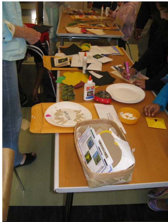
Kids making wildflower Mother's Day cards.

All attendees were given a Nature Guide with colorful pictures of some of the local wildflowers found in the Santa Teresa hills. Many children learned that the hills in Santa Teresa Park could be seen from the large picture windows in the Santa Teresa Library. All were encouraged to hike in Santa Teresa Park and locate some of the wildflowers they could now identify using their Nature Guide.