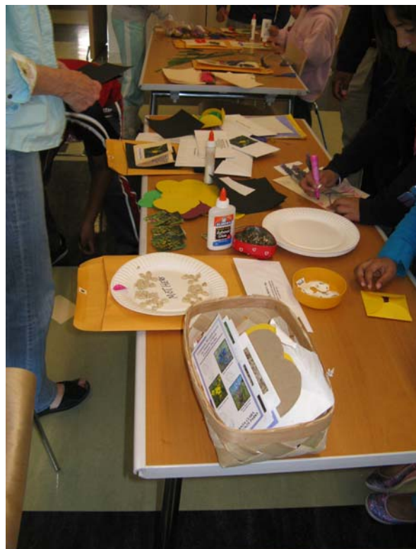
Kids making wildflower Mother's Day cards.

All attendees were given a Nature Guide with colorful pictures of some of the local wildflowers found in the Santa Teresa hills. Many children learned that the hills in Santa Teresa Park could be seen from the large picture windows in the Santa Teresa Library. All were encouraged to hike in Santa Teresa Park and locate some of the wildflowers they could now identify using their Nature Guide.