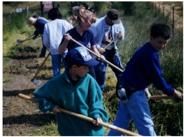
Trail work day on the Stile Ranch Trail

As an elementary teacher at Baldwin Elementary School in the Oak Grove School District, I envisioned a goal to get more families and children to use Santa Teresa Park, appreciate its history and trails, and most of all enjoy the outdoors. Often in class I would ask them if they ever went with their parents to the park? The children always answered, "No!", and then said, "Where is that park?" They were often surprised when I told them to look out the window at the rolling western hills two blocks from the school and that the hills were a park! This is now changed because at that time Santa Teresa Park