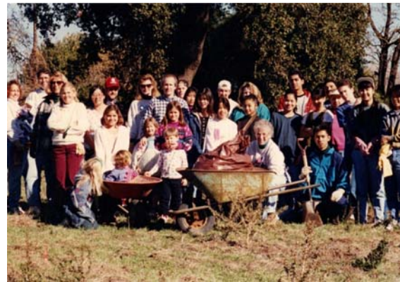
Neighbors, 4th graders from Baldwin School, and their parents spent 2 weeks cleaning up the Bear Tree Lot on Curie Drive.

The Friends of Santa Teresa Park (FOSTP) is a volunteer organization based in San Jose whose purpose is to support Santa Teresa County Park. We are a diverse group with a wide range of interests. Our members include equestrians, hikers, runners, mountain bikers, historians, teachers, photographers, trail crew leaders, geocachers, 4H and scout leaders, and concerned members of the community. We serve as an interface between the community and the parks department. We report on problems and concerns in the park and recommend changes and improvements to the park. We help out with trail maintenance and park events. If you are interested in helping out at the park or just want to know what's going on, you are welcome to join us. See our website for more information.