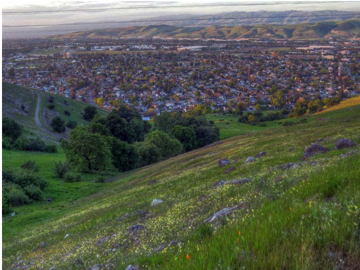
View of the Joice Trail from the Bernal Hill Trail.

We start our hike by taking the Joice trail, which is steep uphill. After 0.1 miles, we intersect the Norred trail, which was built a few years ago and connects the Bernal-Gulnac-Joice and Norred ranches. But today we continue uphill on the Joice trail. This trail gets very muddy after heavy rains in winter. At a certain moment, the trail turns right, and there we have some of the best views of the Silicon Valley. Especially in the evening, when the sun is setting, those views