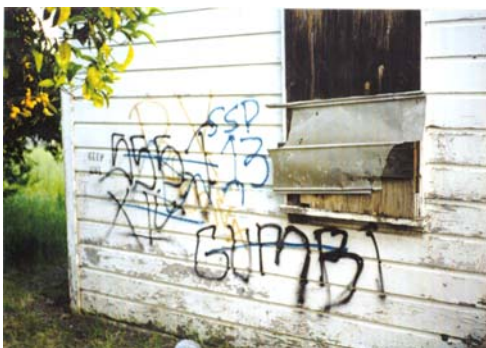
Historic buildings at the Joice-Bernal Ranch were tagged and vandalized before they were restored and turned into an interpretive center at the Santa Teresa Historic Area.