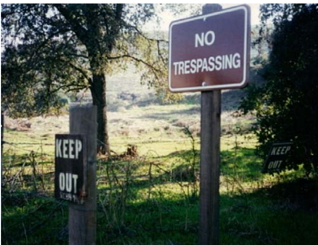
Signs by Santa Teresa Spring before the area was opened to the public.

Last month, Santa Teresa Park's user status has changed. I was delighted and surprised to hear at the June Santa Clara County Parks' Commission meeting that Santa Teresa Park now holds the title as the second most popular park for users in the county park system. I felt proud that all the work FOSTP volunteers donated in monitoring the buildings for vandals, and in helping to plan and build various trails in the park (Ohlone, Stile Ranch, Laurel Canyon, Fortini, Rocky Ridge, and the new Norred Trail) in the last twenty-two years has paid off. The new county statistics showed more adults and children appreciated the access trails we built to the parks' wonderful back-country wildflower trails. The report is all the proof I need to show to my FOSTP members that their work has made a difference, the community appreciates their volunteer work, and has met our goal to make Santa Teresa a bright shiny gem in the county park system. Therefore, I take this time to recognize and thank all the park staff, community members, and volunteers who helped and continue to help us achieve our goal over the last twenty -two years.