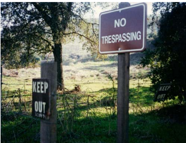
Signs by Santa Teresa Spring before the area was opened to the public.

Last month, Santa Teresa Park's user status has changed. I was delighted and surprised to hear at the June Santa Clara County Parks' Commission meeting that Santa Teresa Park now holds the title as the second most popular park for users in the county park system. I felt proud that all the work FOSTP volunteers donated in monitoring the buildings for vandals, and in helping to plan and build various trails in the park (Ohlone, Stile Ranch, Laurel Canyon, Fortini, Rocky Ridge, and the new Norred Trail) in the last twenty-two years has paid off. The new county statistics showed more adults and children appreciated the access trails we built to the parks' wonderful back-country wildflower trails. The report is all the proof I need to show to my FOSTP members that their work has made a difference, the community appreciates their volunteer work, and has met our goal to make Santa Teresa a bright shiny gem in the county park system. Therefore, I take this time to recognize and thank all the park staff, community members, and volunteers who helped and continue to help us achieve our goal over the last twenty -two years.