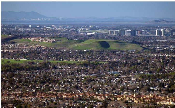
This telephoto view from Coyote Peak includes Palmia, the Martial Cottle Ranch, Communications Hill, downtown San Jose, Mineta San Jose Airport, Mt. Tamalpais, downtown San Francisco, Angel Island, and the Coyote Hills.