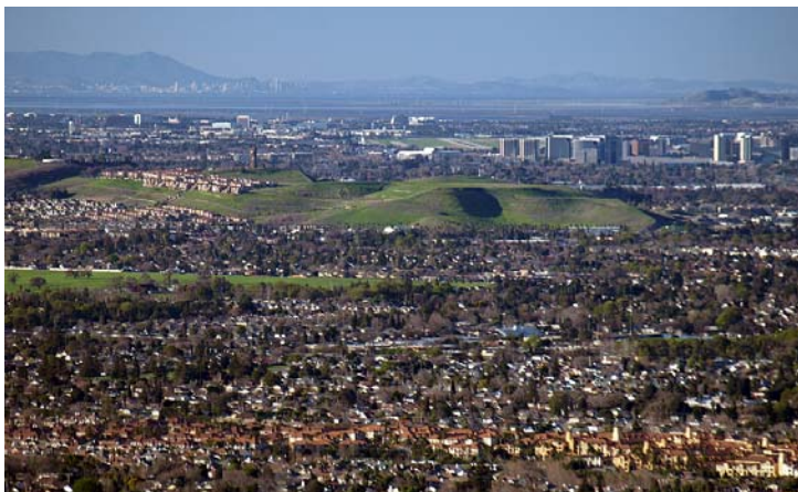
This telephoto view from Coyote Peak includes Palmia, the Martial Cottle Ranch, Communications Hill, downtown San Jose, Mineta San Jose Airport, Mt. Tamalpais, downtown San Francisco, Angel Island, and the Coyote Hills.