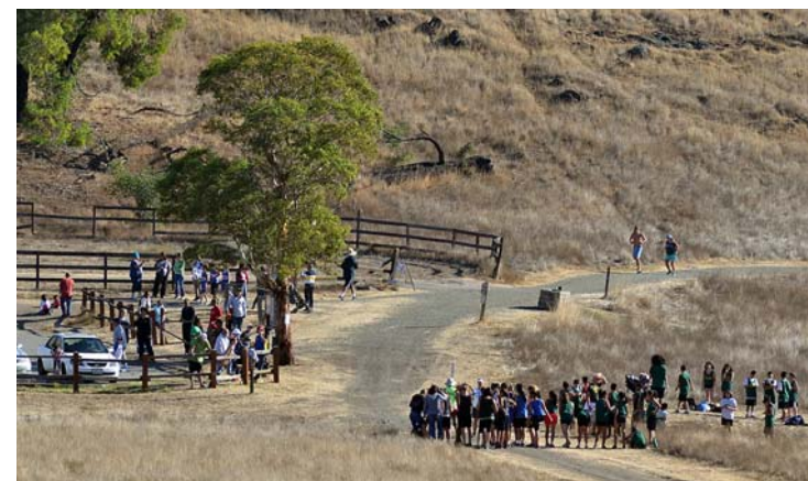
2013 cross country meet at Santa Teresa's Pueblo Area