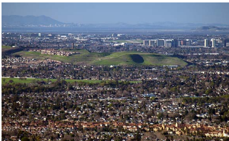
View from Coyote Peak of Martial Cottle Park, Communications Hill, downtown San Jose, Mineta San Jose Airport, Santa Clara, downtown San Francisco, Mt. Tamalpais. (2011)

Our members encourage you to hike up the Coyote Peak Trail to the top of the 1,155 foot hill and enjoy one of the best views in the Bay Area. While you're there, try to identify the changes to the landscape by comparing the picture of the view taken in 2011 to the current view.