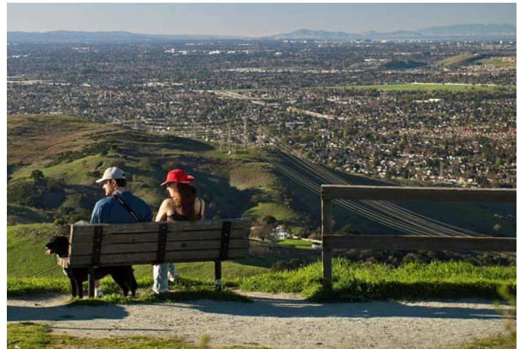
Coyote Peak viewpoint to the north, site of future sign.

Mark your calendar for a spectacular FOSTP and SCCPR event, to dedicate a panoramic view sign of the Santa Clara Valley on top of Coyote Peak in Santa Teresa Park. On October 25, 2014 the main ceremonies will be held at the Pueblo Day Use Area in Santa Teresa Park, starting at 10 a.m. Participants will be allowed to park free, and no admission will be charged. The event will then move to the top of Coyote Peak, where the unveiling ceremony for the new sign will take place between 11 am and 11:30 am. The public will be encouraged to hike or ride one of the County Parks' interpretive vans to the top of the peak. Bring your cameras and telephoto lenses to capture photos of far distant landmarks of the Bay Area.