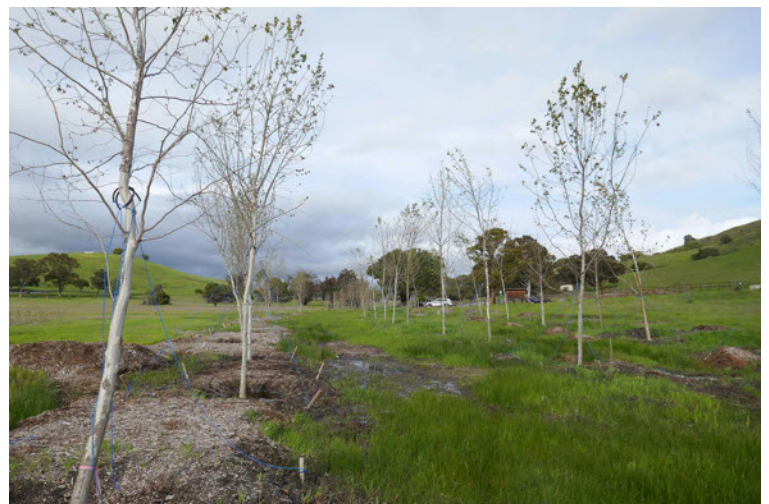
Sycamore trees in the Pueblo Area, April 2023