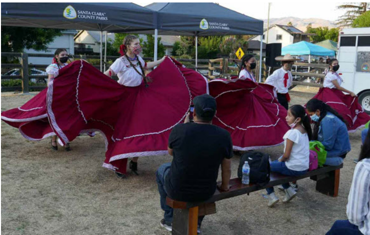
Folklorico dancing, La Fuente 7/30/22