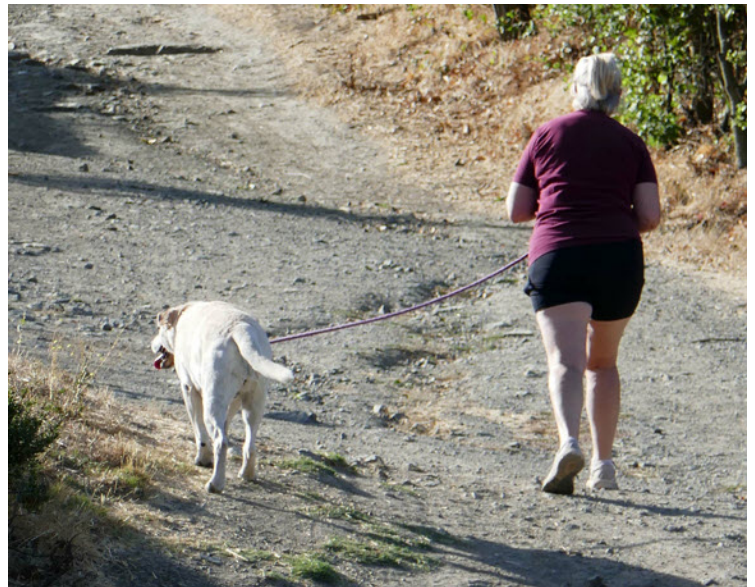
Dog walker on the Joice Trail