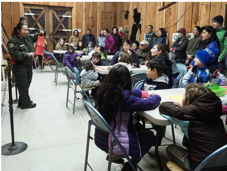
On 1/18/19, there was a Lunar New Year event, with outdoor demonstrations of the phases of the moon and this activity making Chinese lanterns.