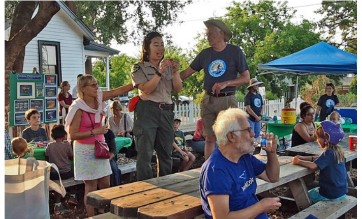
National Night Out, 8/7/18, see page 2