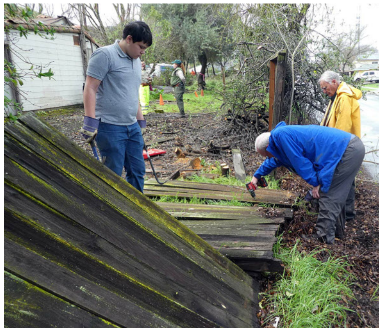
Volunteers work on restoring the fence on 3/2/19.