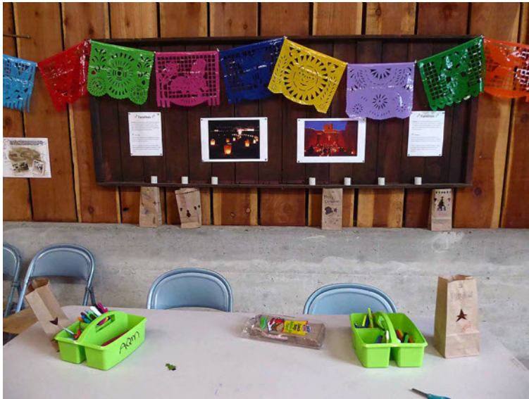
There were Christmastime decorations and activities in 2018 at the Bernal Ranch. This is making Mexican farolitos, or lanterns.