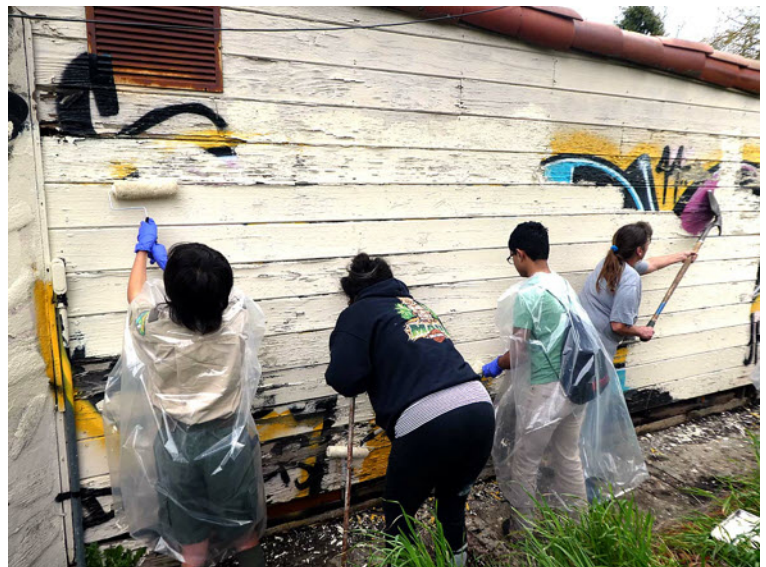
Volunteers work on painting over graffiti on 3/3/19.