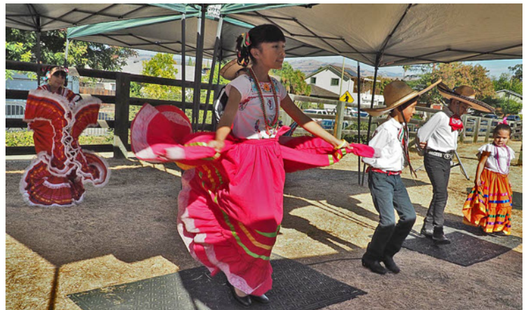
La Fuente, 10/27/18, see page 7