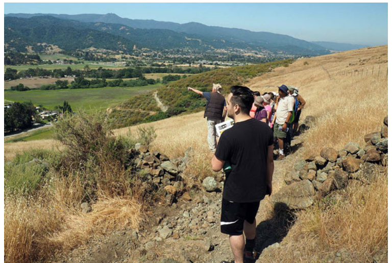
On 5/11/19, the Friends of Santa Teresa Park led a Pre-Mother's Day Hike on the Stile Ranch, Mine, and Fortini Trails.